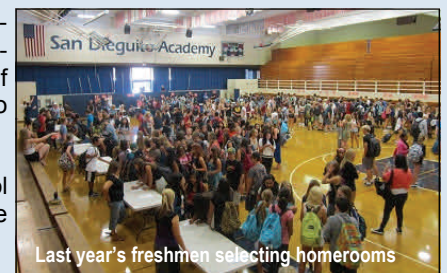
Last year's freshmen selecting homerooms

San Dieguito Academy offers a special opportunity for freshmen in an effort to better acclimate them to SDA's culture. For the first week of school, freshmen will not go to homeroom. Instead, during the homeroom period (9:27 to 9:47 a.m.) they will attend a series of workshops that will give them all the information they need to make a smooth adjustment to high school.