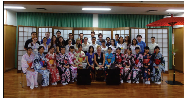
Our students conducted themselves with dignity and grace. This trip will have a lasting impact on our students.

Students toured the Tokyo National Museum, the Okinawa Prefectural Museum and Art Museum, Shuri Castle, the National Museum of Emerging Science and Innovation, the Meiji Shrine and the Edo-Tokyo Museum. They visited the National Diet Building in Tokyo (Japan's Congress) and had an exceptional opportunity to learn about the devastation of war and the importance of peace when they met with the curator of the Peace Museum in Okinawa and toured Peace Memorial Park.