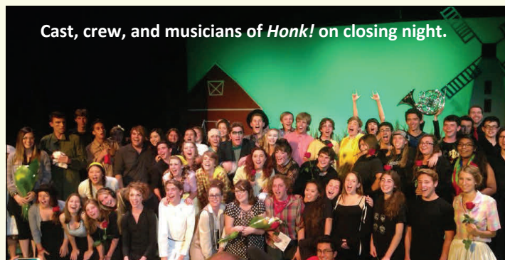
Cast, crew, and musicians of Honk! on closing night.